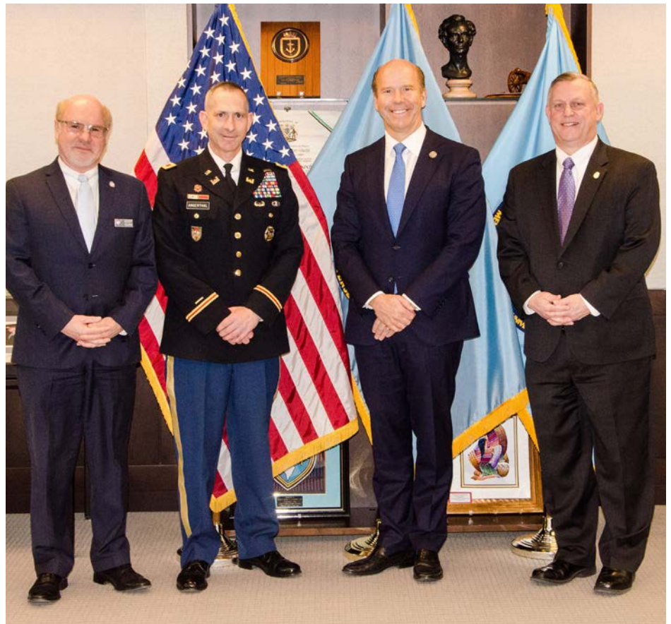
Representative John Delaney (Maryland - 6th District) visits the Perry Center to meet with faculty members to discuss the complex security environment in the Americas and explore implications for US policymakers.